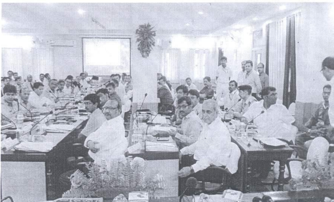
District Judges, District Magistrates and Supdts. of Police from the Districts in Tirhut, Saran, Koshi and Darbhanga Commissionerate at the Review Meeting held at Darbhanga Collectorate on 12 th April, 2015