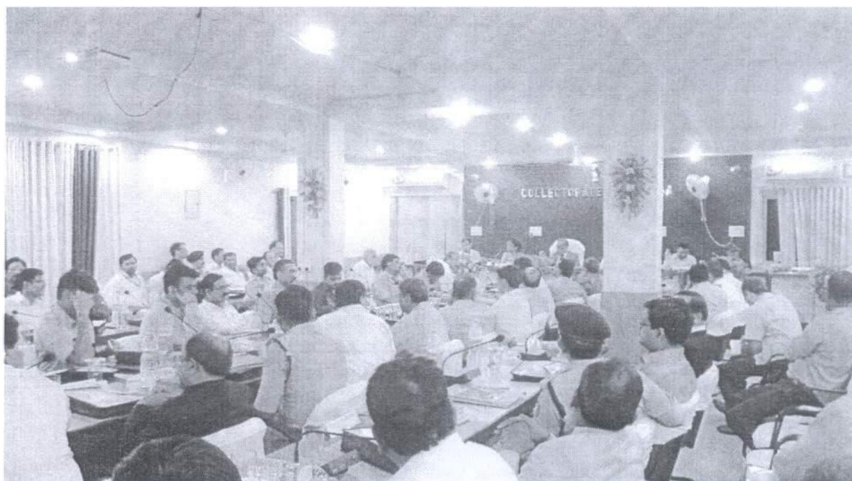
District Judges, District Magistrates, Supdts. of Police from Districts of Four Commissionerates of Tirhut, Saran, Koshi and Darbhanga Participating in the Review Meeting held at Darbhanga Collectorate on 12 th April, 2015