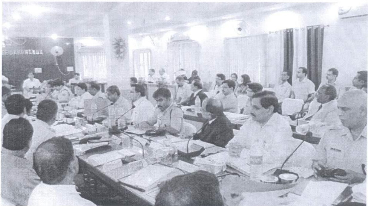
Participants (District Judges, District Magistrates and Superintendents of Police) from different districts