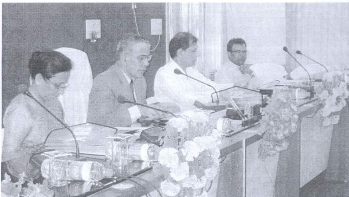
Hon'ble Justice V. N. Sinha, Chairperson, Patna High Court Monitoring Committee on JJ System (Sitting 2nd from left) reviewing the performance of districts in the implementation of programmes under JJ Act, 2000 and ICPS

The review meeting was presided over by the Chairperson of the Hon'ble Patna High Court Monitoring Committee on Juvenile Justice. Other members who were present on the dais and facilitated the review process comprised the following: