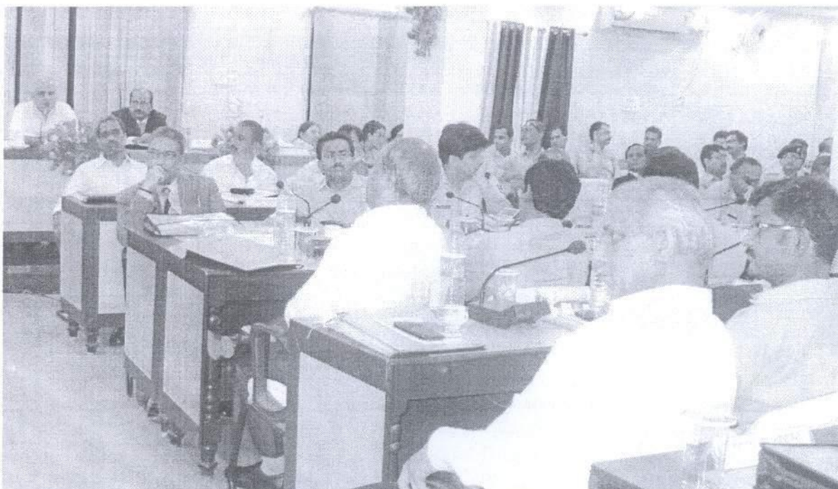
District Judges, District Magistrates and Supdts. of Police from the Districts in Tirhut, Saran, Koshi and Darbhanga Commissionerate at the Review Meeting held at Darbhanga Collectorate on 12 th April, 2015