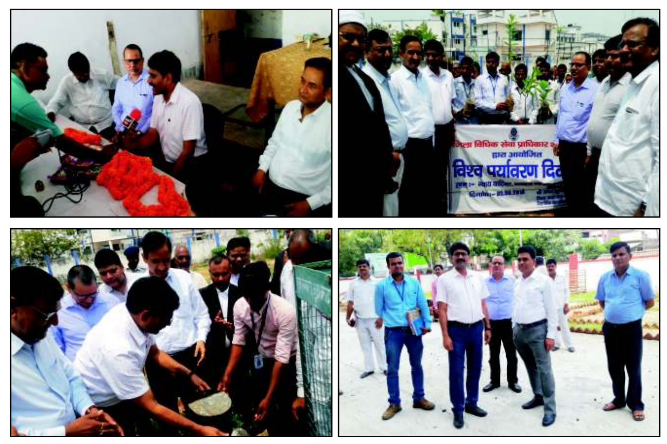
Tree Plantation Programme in DLSA.