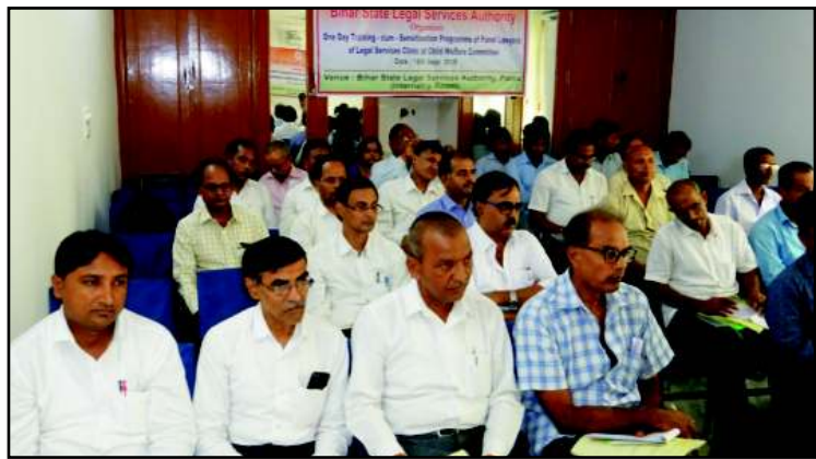
Participant Panel Lawyers

Three Panel Lawyers of each district deputed at the 'Front Office' on 22.09.2018 at BSLSA were sensitized about their role and work at 'Front Office'.