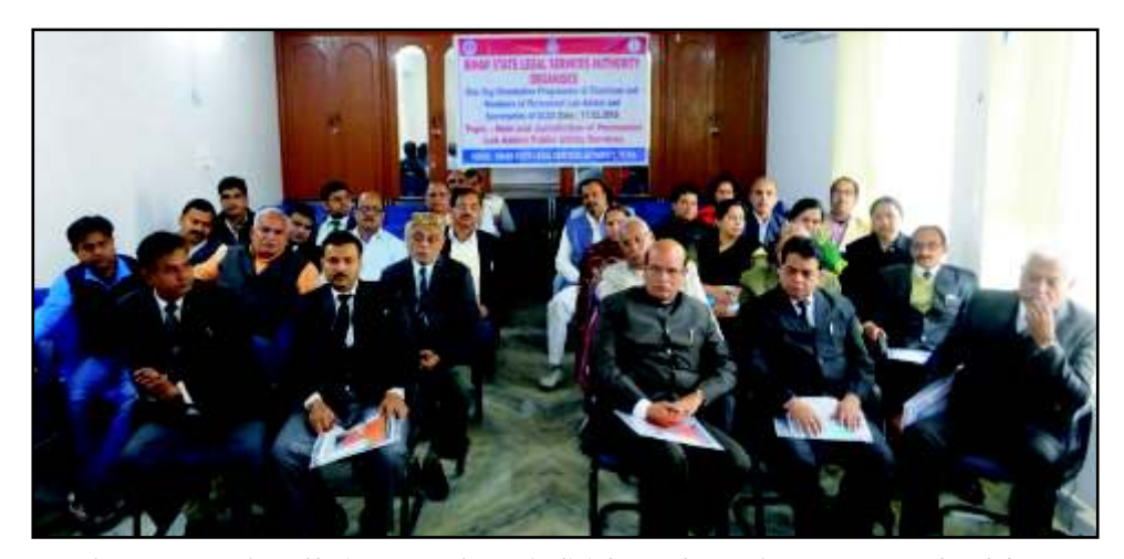
Secretary, DLSAs, Chairman and non-judicial members of Permanent Lok Adalat.