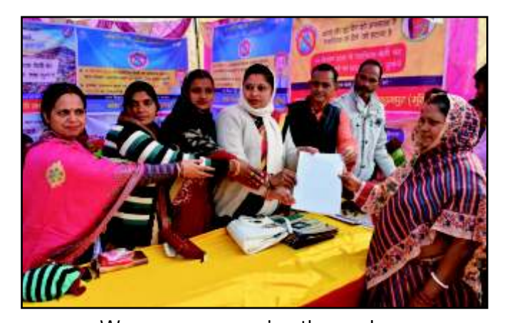
Women empowering themselves.