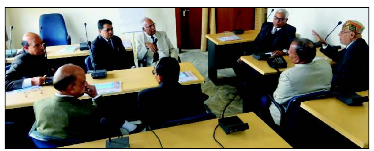
Group Discussion among the Chairman and non-judicial members of Permanent Lok Adalat.

The programme extensively covered the Role and Jurisdiction of Permanent Lok Adalat & Supervision of work.