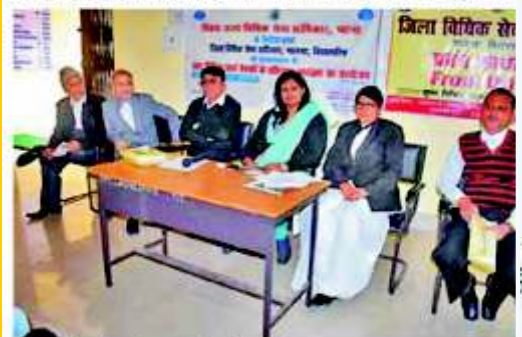
प्रशिक्षण दे रहे न्यायिक पदाधिकारी व अधिवक्ता।

विधि स्वयंसेवकों को तीन दिनों तक मिली ट्रेनिंग