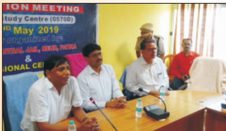
As a part of Summer Internship programme 2019, Students Visited Beur Central Jail, Patna