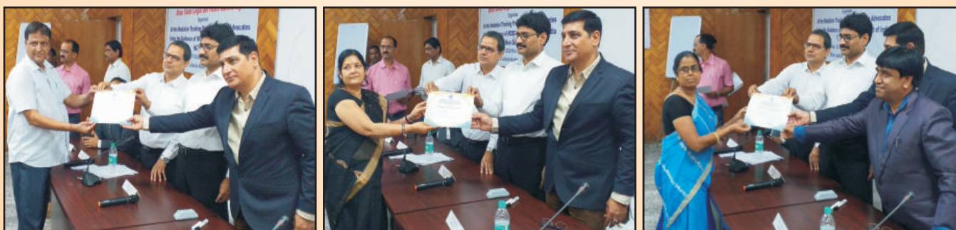
Handing over of the Certificate to the Participants by Member Secretary, BSLSA.