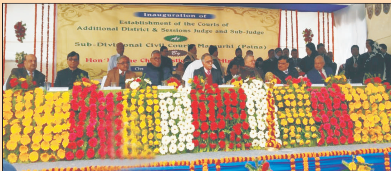
Inauguration of Establishment of the Courts of Additional District & Session Judge and Sub-Judge at Sub-Divisional Civil Court, Masaurhi (Patna) on 29th, December 2019.