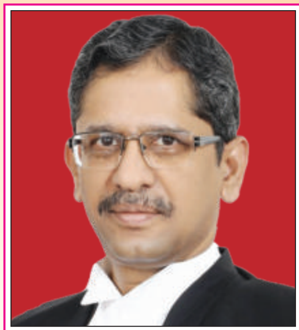
Hon'ble Mr. Justice N. V. Ramana

Chief Justice of India -cum- Patron-in-Chief, NALSA