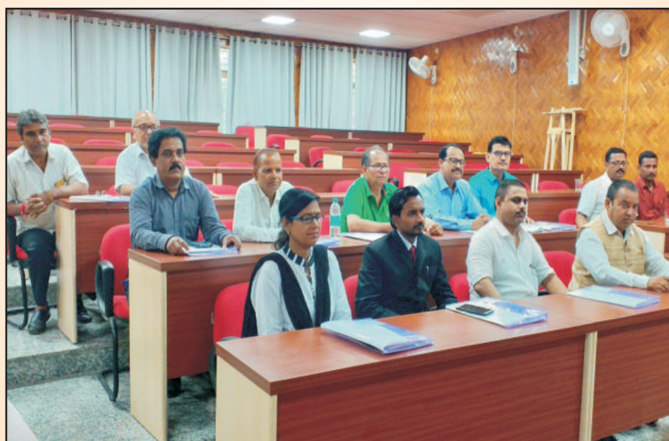
Group of Participants.