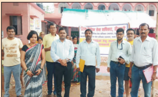
Flood Relief Programme organized by DLSA Sitamarhi.