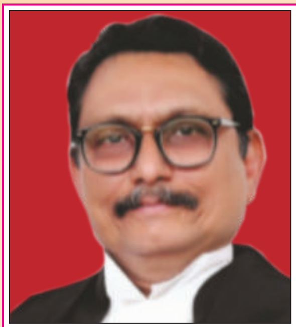
Hon'ble Mr. Justice S. A. Bobde

Chief Justice of India -cum- Patron-in-Chief, NALSA