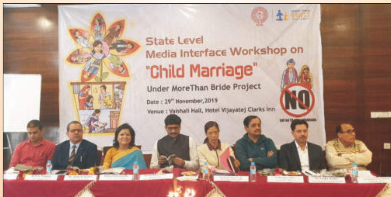
State Level Media Interface Workshop on "Child Marriage" Under More Than Bride Project was held at Vaishali Hall, Hotel Vijayatej Clarks inn on 29th November, 2019.