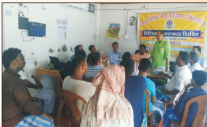
Legal Awareness Camp was organised by DLSA Kishanganj.