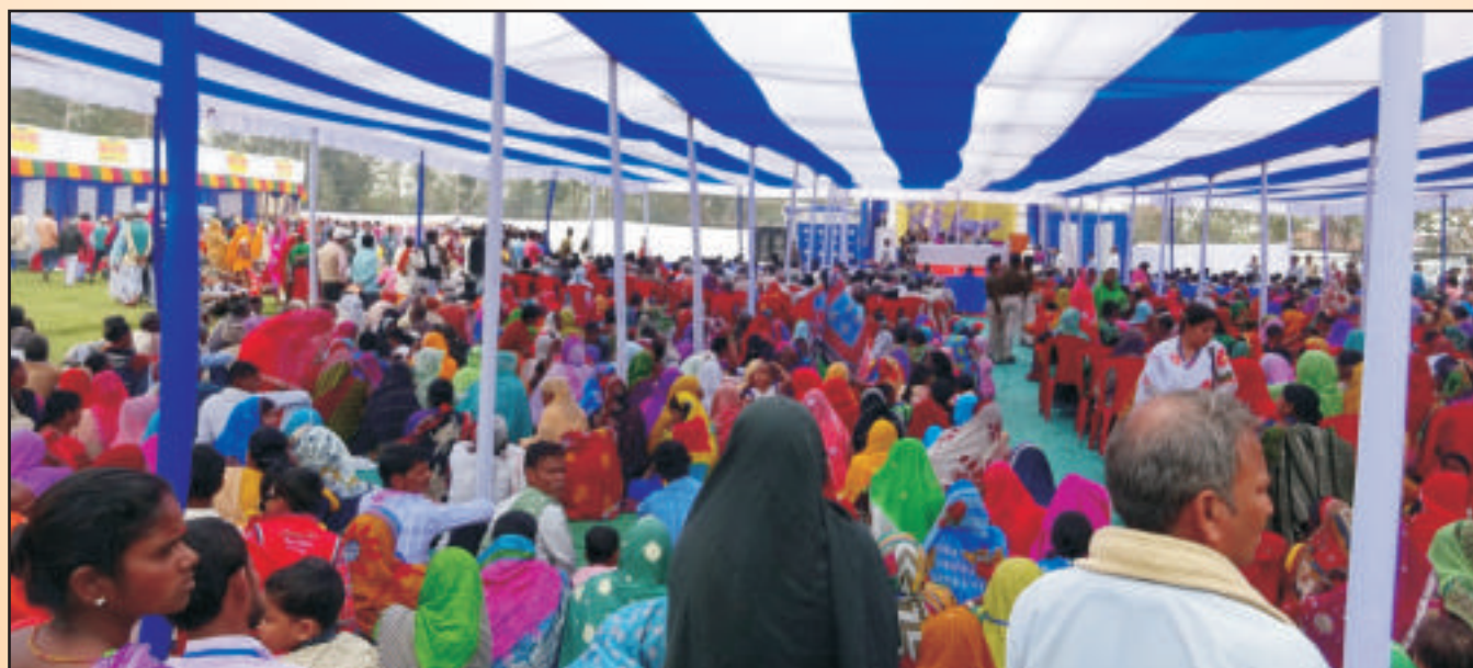
View of one of the Literacy Camps.