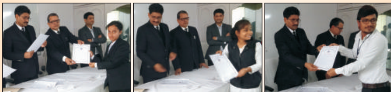
Handing over the Certificate to the Law Students.