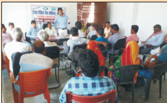
Legal Awareness Programme on Law and Procedure of adoption conducted on 2nd June 2019 at Gopalganj.