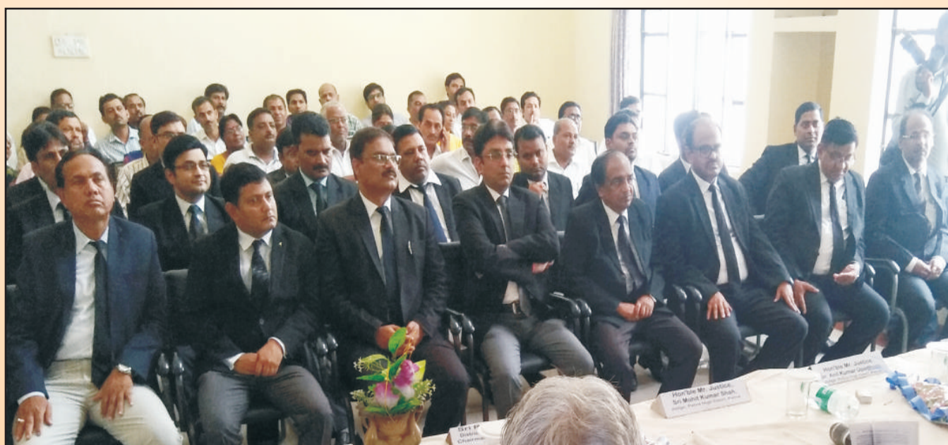
Legal Awareness Programme conducted by DLSA, Darbhanga on 5-5-2019 at Bahadur Panchayat.