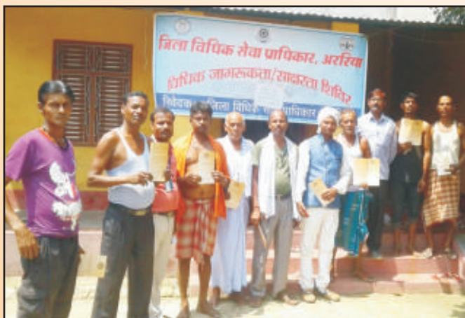
DLSA Araria organised Legal Awareness -cum- Legal Literacy Camp on 1st May 2019.