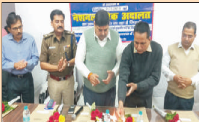
Inaugural Programme of National Lok Adalat held at Gopalganj on 9th March 2019.