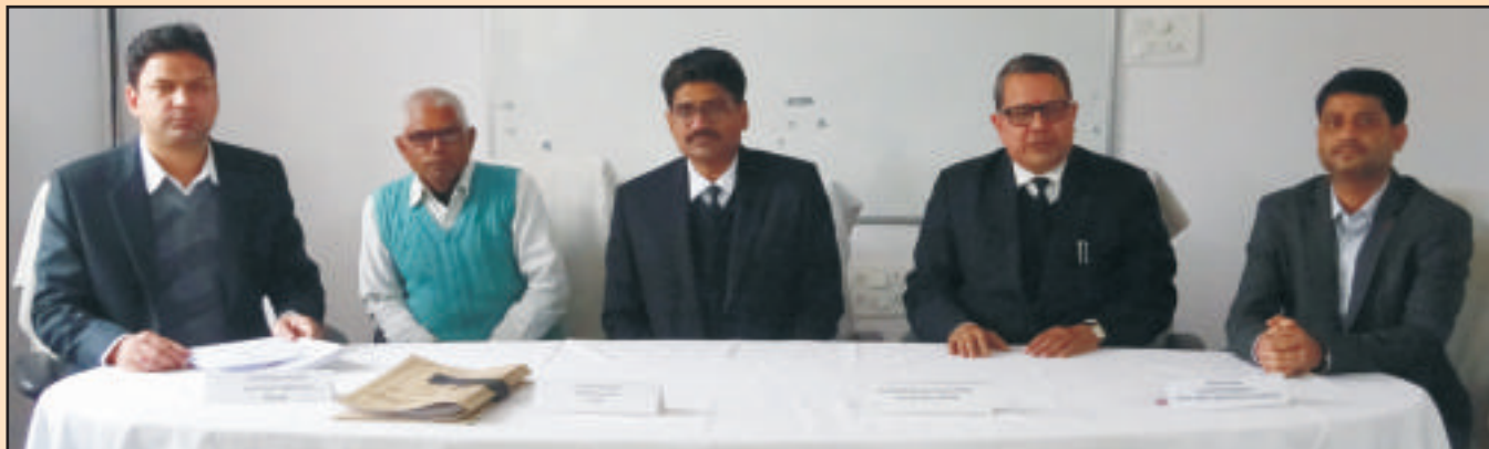
Member Secretary, Joint Secretary BSLSA interacting with Law Students.

3rd January to 23rd January 2019 Winter Internship was conducted at the BSLSA which was attended by law students from different Law Colleges of India.